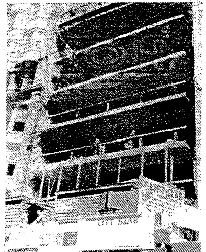
Here the building's floors have been lifted on fasteners in position. These photos are of the recently completed 10-story Gibb and Beeman House in Sydney.

• There is a considerable saving in labor.