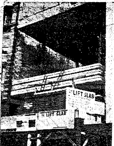
This picture, with the one at far right, shows the operation of the Lift Slab construction method. Here one floor has been lifted on the steel girders while the remaining floors are stacked together waiting to be lifted.

STEEL AND CONCRETE ARE NOW TRANSLATING TORBRECK FROM A DREAM TO A REALITY!